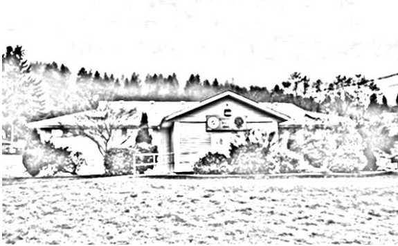
KINSMEN HALL 516 Gower Point Rd.